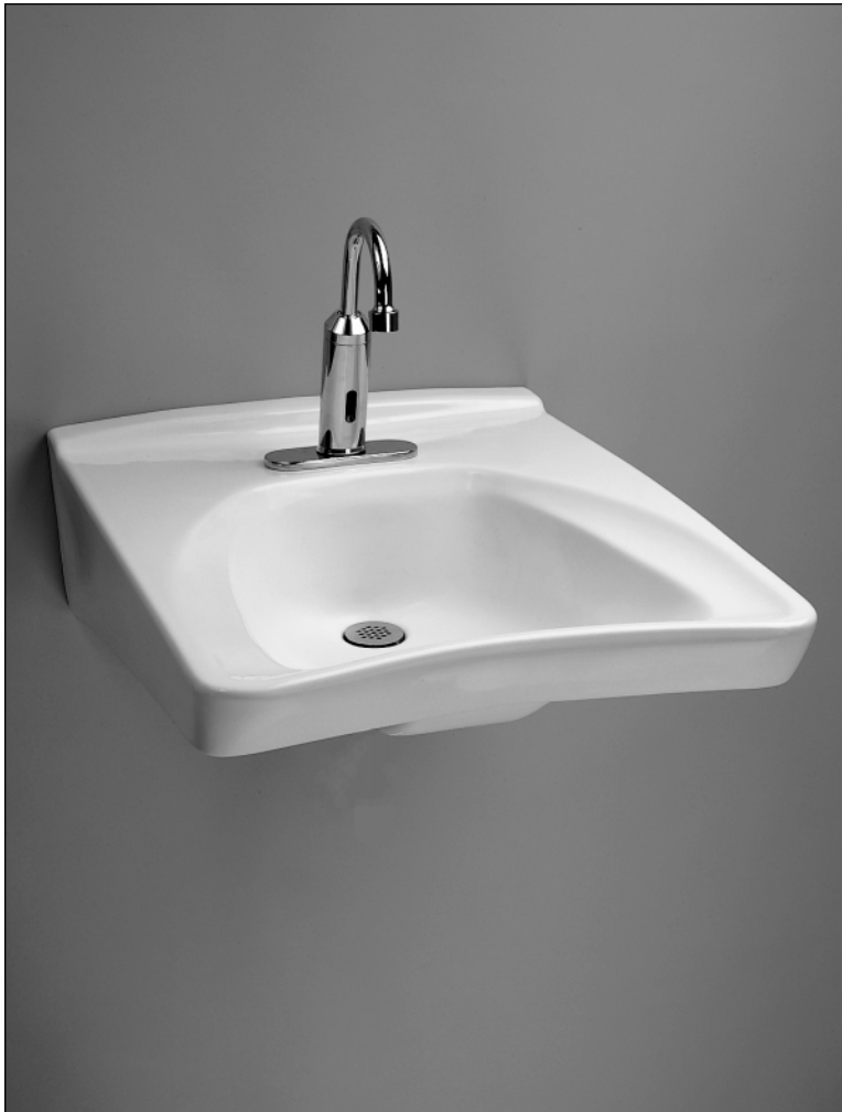
LT308.4 - Wheelchair Users Lavatory