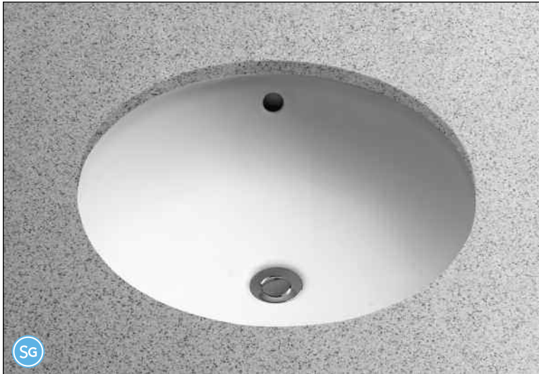
LT193(G) - Round Undercounter Lavatory