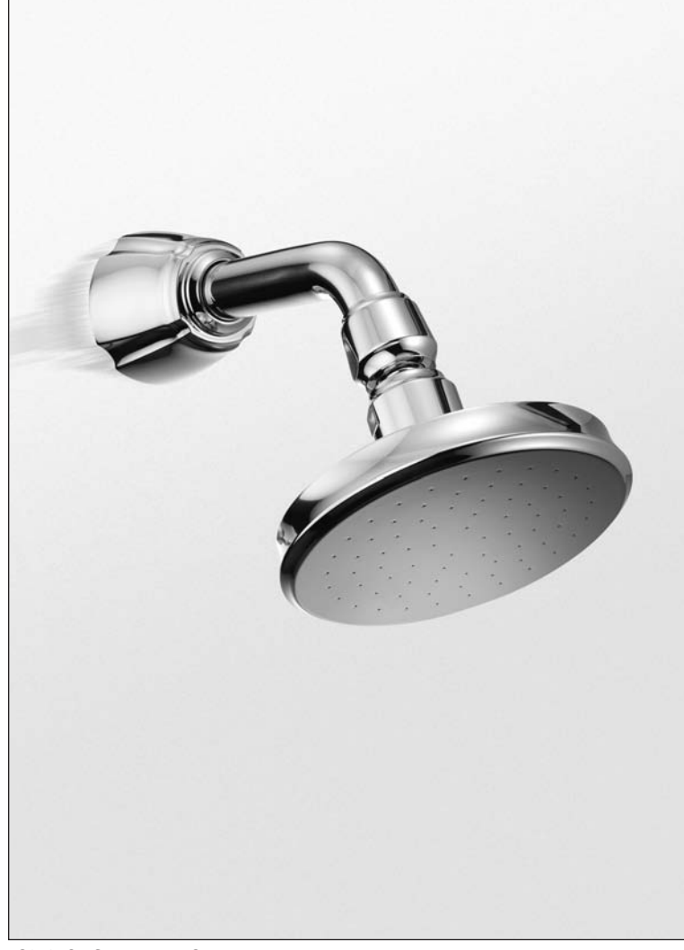
TS970AC - Guinevere<sup>™</sup> Showerhead