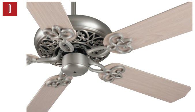
A Antique White Distressed Cecilia with 52" Contractor's Design Antique White Blades

Model-Finish CC52AWD Blade-Finish BCD52-AW Light-Finish Not Shown