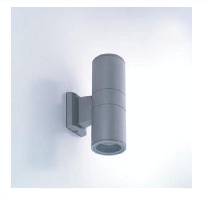
Cylinder wall light for up-and-down lighting. Exterior grade. Cast aluminum construction with powder coat paint. Clear glass lens, unit is completely enclosed.