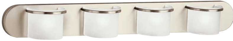
A | 6091 NI

BRUSHED NICKEL, POLISHED CHROME OR TANNERY BRONZE™ FINISH