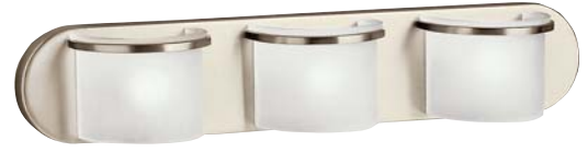
B | 6090 NI