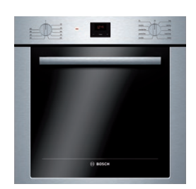
HBE5451UC Stainless Steel

The 24" Bosch Wall Oven features Genuine European Convection and is Designed for Kitchens with a Smaller Footprint