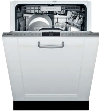
SHVM98W73N Custom Panel

The MyWay™ easily fits larger & deeper items like cereal bowls, freeing up extra space for pots & pans in the bottom rack.