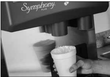
SensorSAFE not recommended for use with clear containers or for applications in direct sunlight