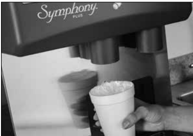
SensorSAFE not recommended for use with clear containers or for applications in direct sunlight