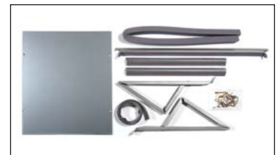
KWIKSB, KWIKMB, KWIKLB