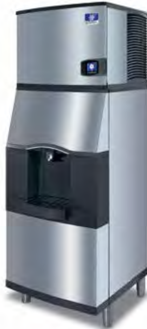
Indigo NXT iT0450 Ice Machine SPA-310 Ice Dispenser

With Indigo and Indigo NXT ice machines you can program the ice machines to be off certain hours of the day so that while the hotel guests are sleeping, the ice machine can be too!