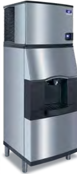
Indigo NXT iT0450 Ice Machine SFA-291 Ice & Water Dispenser