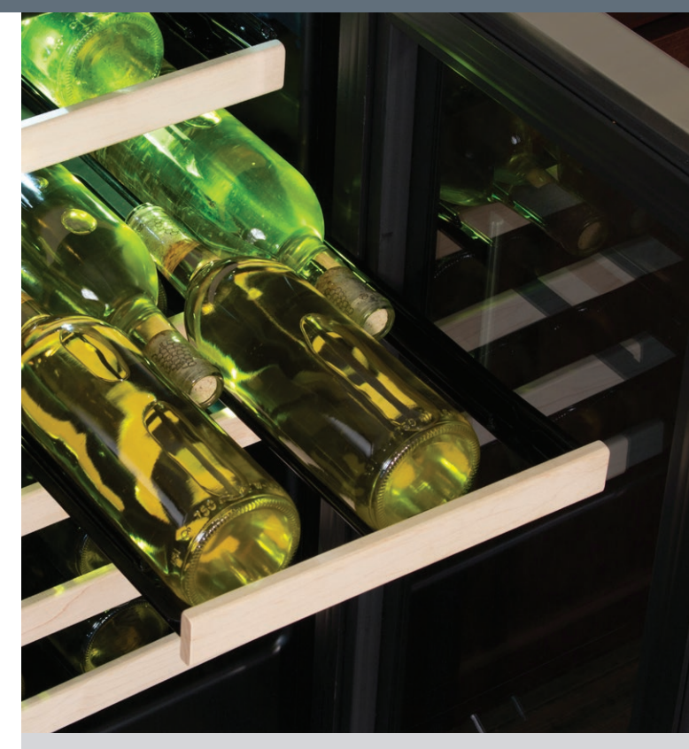
The energy- and space-efficient way to store fine vintage wines, this slim Marvel Wine Refrigerator stores 24 bottles in the optimum wine preservation environment.

• 1-year parts and labor warranty and 5-year sealed system parts warranty