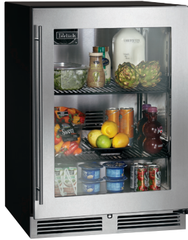
Indoor Glass Door Model

Perlick ® QUALITY & INNOVATION THAT INSPIRES