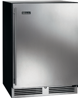
Outdoor Solid Door Model