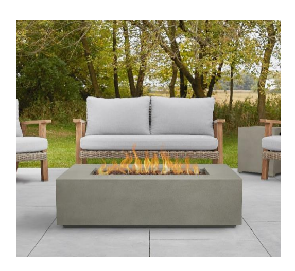
Available in Mist Gray (C9811LP-MGRY)