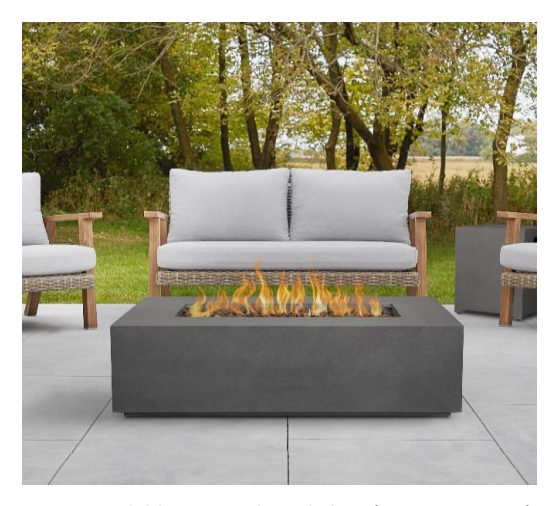
Available in Weathered Slate (C9811LP-WSLT)