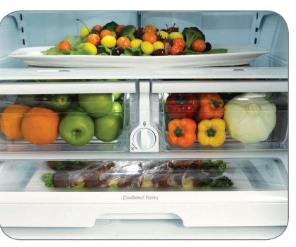
CoolSelect Pantry™ with Temperature Control