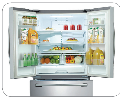
French Door Design