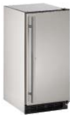
STAINLESS SOLID (LOCK)