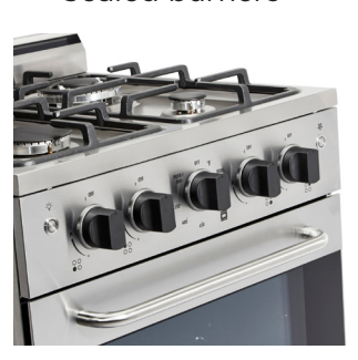
Modern knobs designed for cooktop & oven