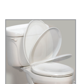
WHISPER • CLOSE® FEATURE