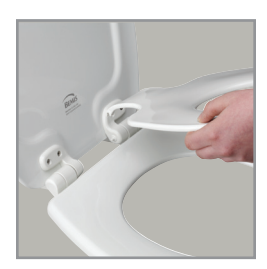
REMOVABLE CHILD SEAT