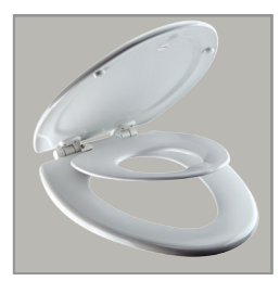
CHILD SEAT SECURES MAGNETICALLY INTO COVER WHEN NOT IN USE