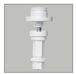
STA-TITE® RESIDENTIAL FASTENING SYSTEM™