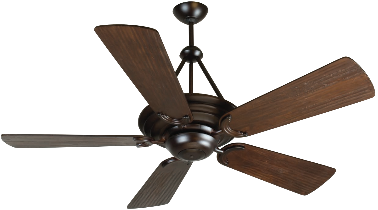
Oiled Bronze Metro with 54" Premier Hand-Scraped Walnut Blades | Model . . . ME520B Light . . . . . Not Shown