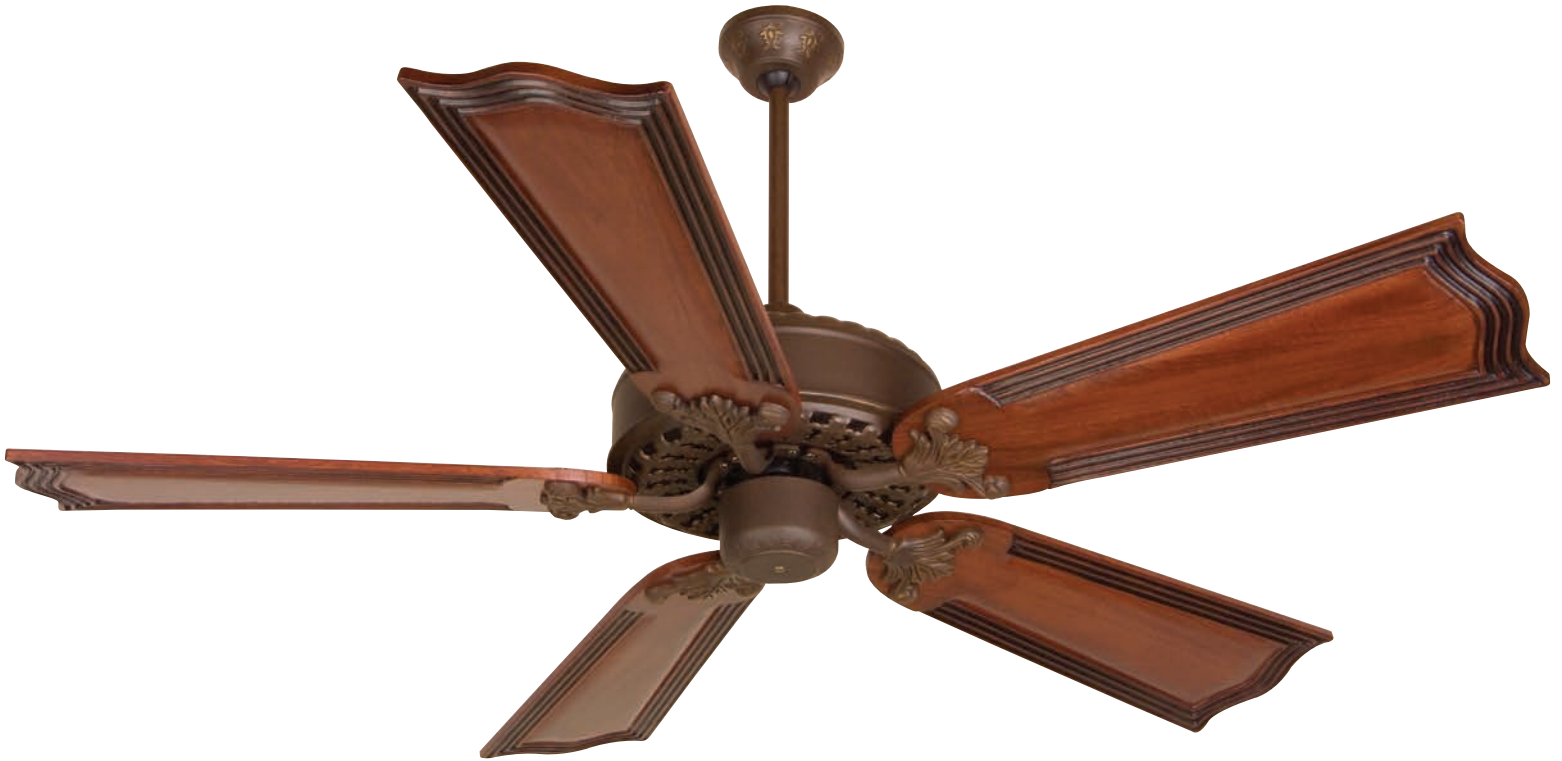
Aged Bronze Textured Presidential II | Model . . . P252AG with 56" Custom Carved Wellington | Blade . . . B556C-W5 Mahogany Blades | Light. . . . . Not Shown