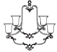
Drawing 1 - Fixture Assembly