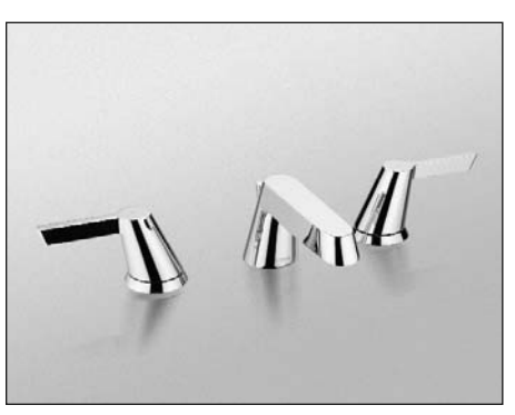
TL690DD - Ethos™ Design NII lavatory faucet