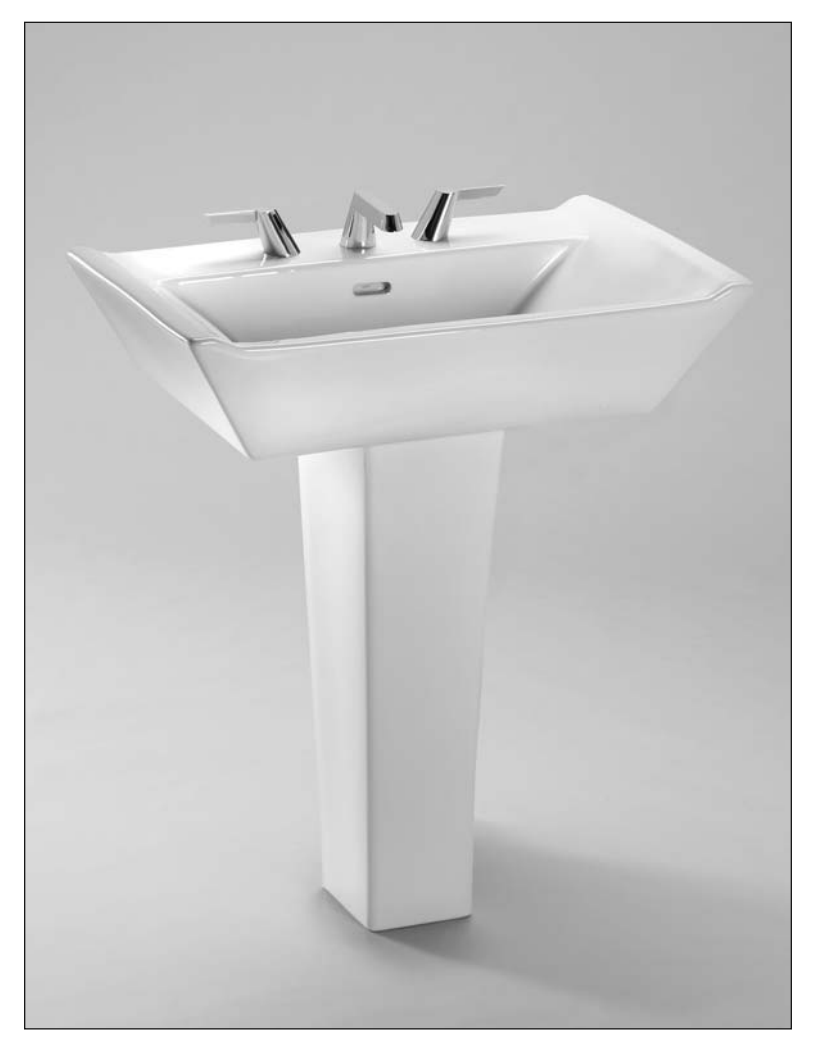
LPT690.8G - Ethos™ Design NII Pedestal Lavatory