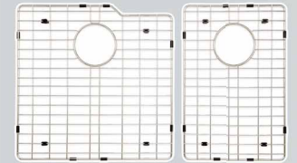
Basin Rack Set 737-STC