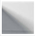
WHITE ENAMEL (MCI37-0UM-20)