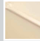
BISCUIT ENAMEL (MCI37-0UM-22)