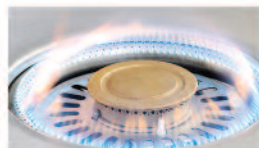
Outer burner adjusts from 5,000 to 45,000 BTU