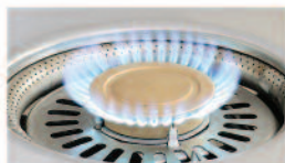
Center burner adjusts from 400 to 20,000 BTU