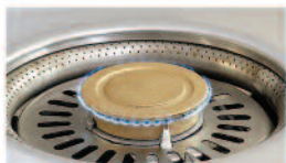
Simmer delicate sauces at a low 400 BTU