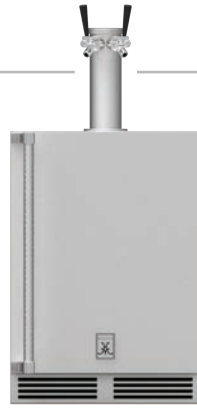
24" Beer Dispenser