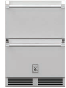
24" Refrigerated Drawers / 24" Refrigerated Drawer and Freezer Drawer