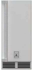
15" Ice Machine