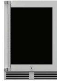
24" Dual Zone Refrigerator with Wine