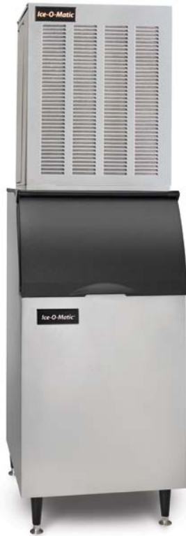
MFIO500 ON B42