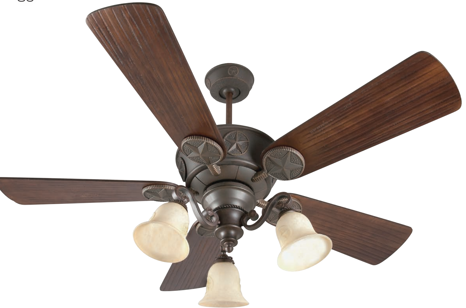
Aged Bronze Textured Chaparral | Model . . . . CP52AG with 54" Premier Hand-Scraped | Blade . . . . B554P-WAL Walnut Blades and Light Kit | Light. . . . LK44CFL-AG