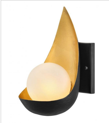
47900BLK SINGLE LIGHT SCONCE 5.5" W, 9.8" H Socket 1-60w G-9

FINISH: Black with Deluxe Gold accents GLASS: Faux Alabaster